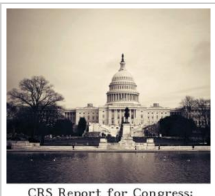
CRS Report for Congress: China-U.S. Trade Issues June 21, 2010 - RL33536

Congressional Research Service: The Library of Congress